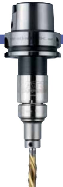
HSK-A63-HA412-M-OHC + TC412-MO-SB