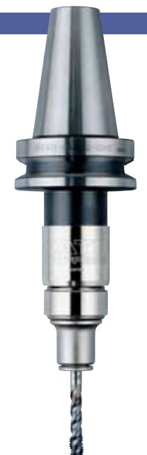
BT-HA412-M-OHC + TC412-MO