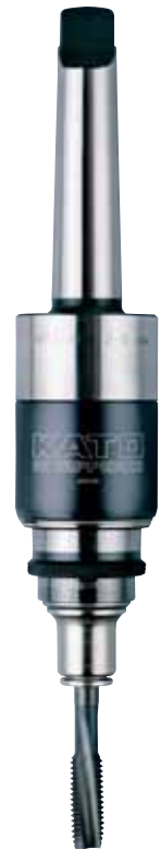
MT3-SA412-II + TC412