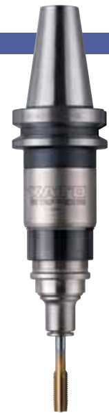
BT50-SA1022-III + TC1022-MO

※F2 and F4 are referential values. ※F2,F4量は参考値です。