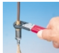
①Open and hook on nuts.